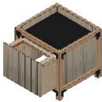
(1) Corn Husk Orchard Bin BD0572