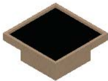
(1) Square Pedestal Riser PR0119