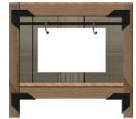
(6) Sign Holder Rods BD0610