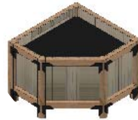
(1) Wedge Orchard Bin BD0573