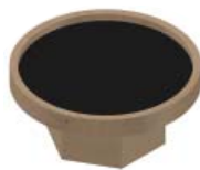
(1) Round Pedestal Riser PR0120