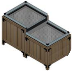
(1) Refrigerated Orchard Bin RBD0100